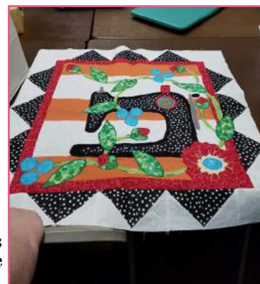
BRANDI'S SHOW & TELL