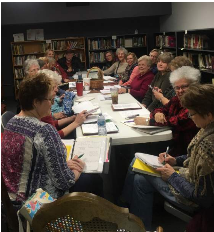
Your Quilt Show Committee at work!