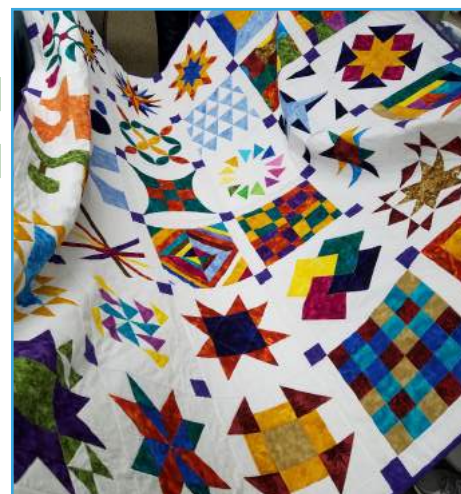
SHEENA'S COMPLETED APPRENTICE QUILT!!!