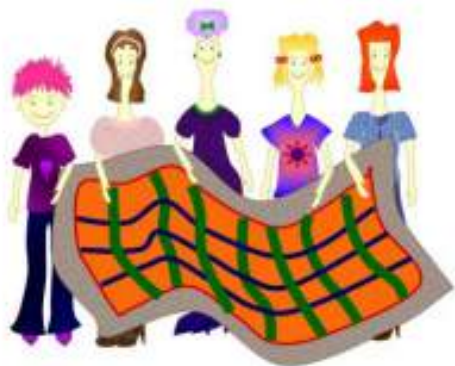
The Q.U.I.L.T. Guild of Northwest Arkansas