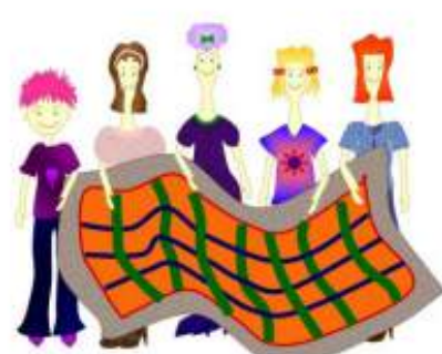
The Q.U.I.L.T. Guild of Northwest Arkansas